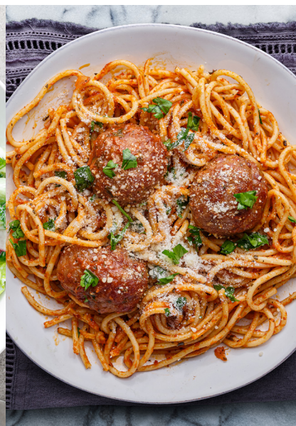
use cheese to bulk up meatballs