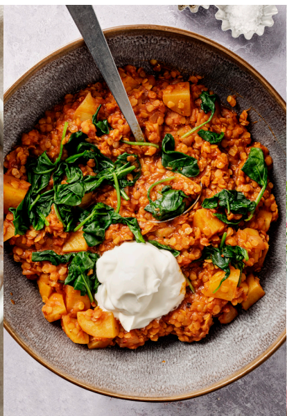
dollop yogurt on top of soup