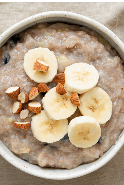
cook oatmeal with milk