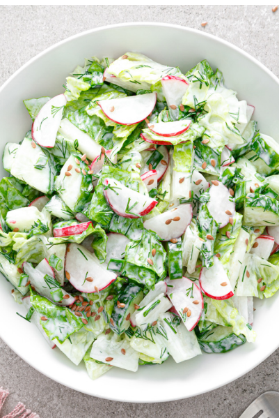
dress up your salad with yogurt or use it to make an herby, creamy sauce